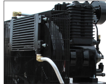
Air cooled after cooler Elite unit