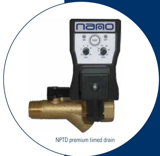
NPTD premium timed drain