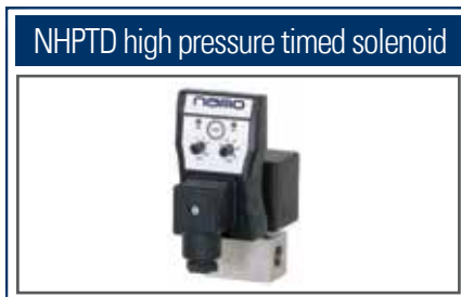
NHPTD high pressure timed solenoid

nano-purification solutions charlotte, north carolina united states