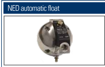
NED automatic float