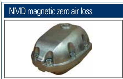
NMD magnetic zero air loss