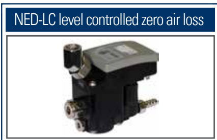
NED-LC level controlled zero air loss