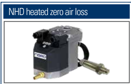
NHD heated zero air loss