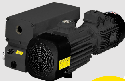
RVL80HS 87.5 CFM, 4.8 HP