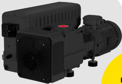
RVL185HS 200 CFM, 8.8 HP