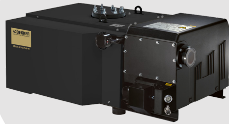
RVL400HS 449 CFM, 25 HP

The rugged and reliable design of the Dekker® Duravane® series makes it the ideal choice for many demanding and harsh applications. Industrial processes like those in woodworking, plastics, electronics, paper printing, packaging, and material handling, all require a vacuum pump that can perform under pressure. The kind of performance under pressure the Duravane® can deliver.